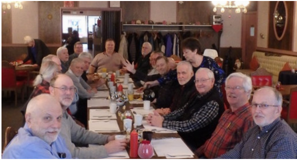
Breakfast at the Superior Restaurant