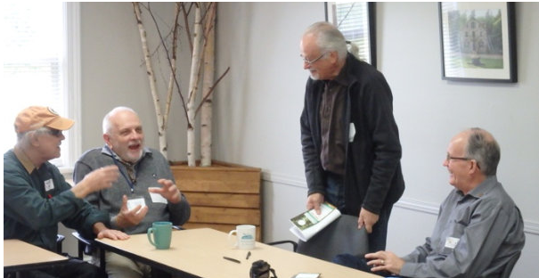
A meeting at the Mill of Kintail Gatehouse