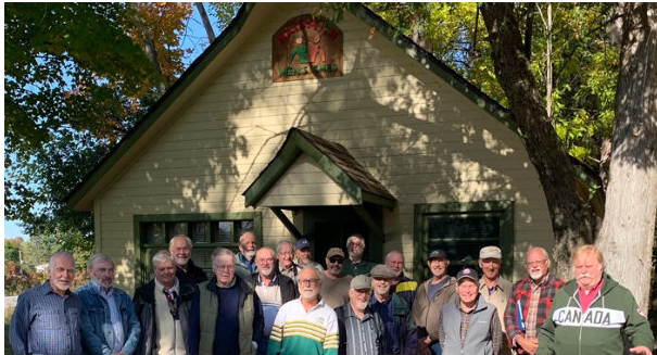
Our shed at the Mill of Kintail