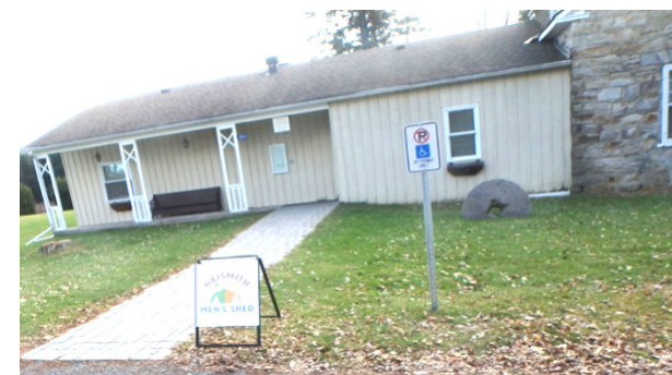
The Mill of Kintail Gatehouse meeting place