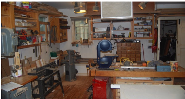
The workshop in Appleton